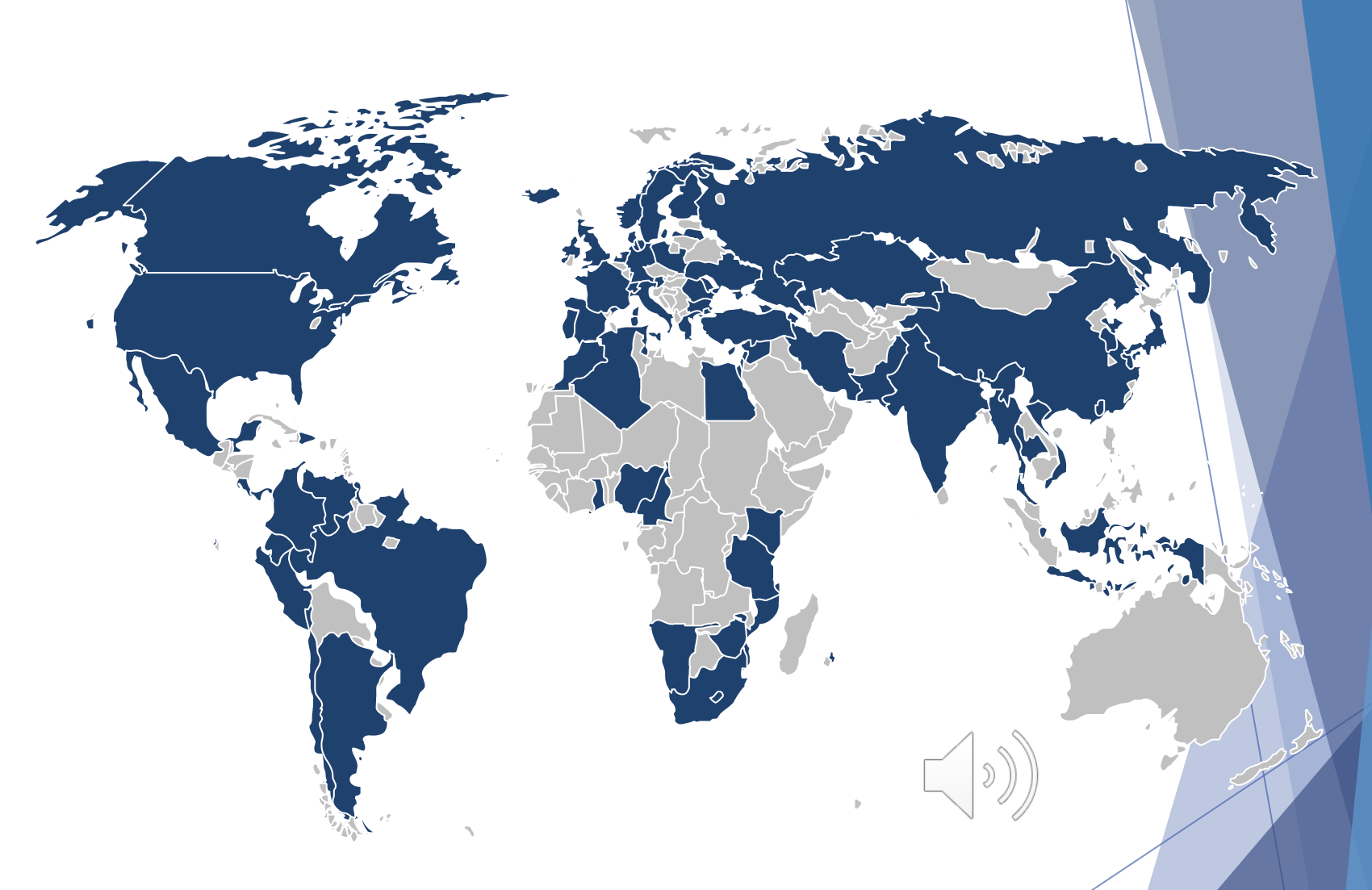
Algeria Argentina Austria Azerbaijan Bangladesh Brazil Bulgaria Cameroon Canada Chile China Colombia Costa Rica Cyprus Denmark Dominican Republic Ecuador Egypt Finland France Georgia Germany Ghana Greece Honduras Iceland India Indonesia Iran Israel Italy Japan Kazakhstan Kenya Latvia Lebanon Malaysia Mauritius Mexico Moldova Morocco Mozambique Namibia Netherlands Nigeria Norway Pakistan Palestine Panama Peru Poland Portugal Romania Russia Singapore South Africa South Korea Spain Sweden Switzerland Syria Taiwan Tanzania Thailand Trinidad and Tobago Turkey Ukraine United Kingdom United Arab Emirates United States of America Venezuela Vietnam Zimbabwe